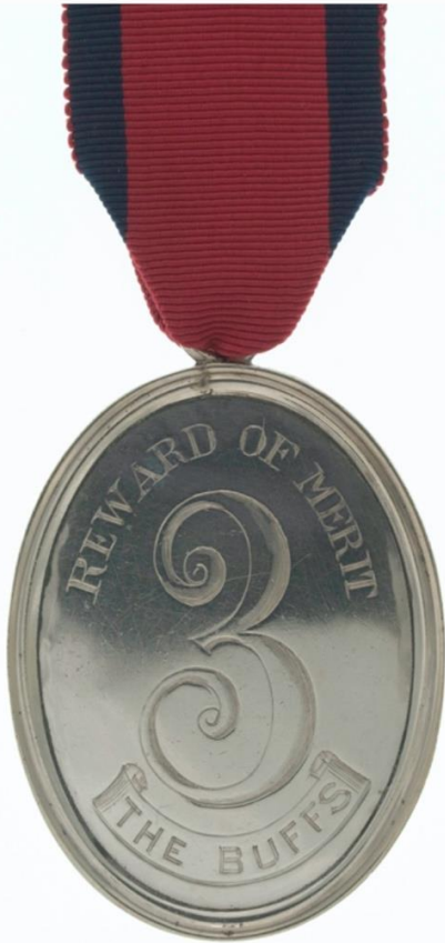
Meritorious service award 3 rd Reg