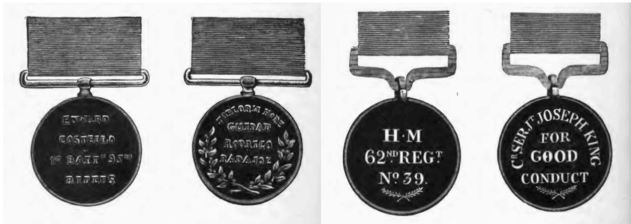
Regimental award, 95 th Forlorn hope. Ciudad Rodrigo.